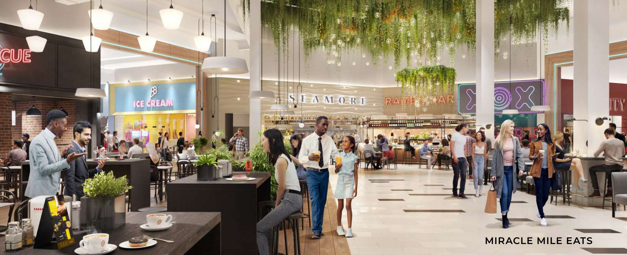
MIRACLE MILE EATS